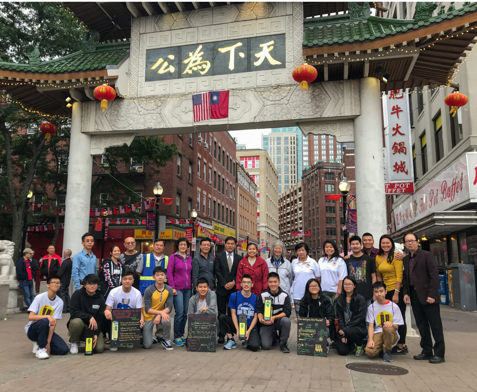
Tufts MC community partnership to keep Chinatown clean of cigarette butts and educate on the harms of smoking

Questions? Please email CHNA@tuftsmedicalcenter.org