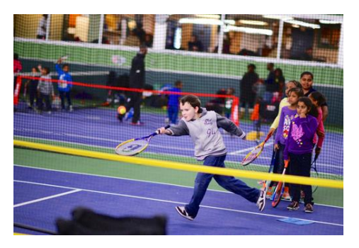
Youth participant plays tennis as part of Sportsmens' Tennis and Enrichment Center's Volley Against Violence program

With support from Tufts MC's DHI, Boys & Girls Clubs of Dorchester and Sportsmens' Tennis and Enrichment Center provided youth programming for children and teens in Dorchester neighborhoods. In addition to mentoring, physical activity, and after school and summer