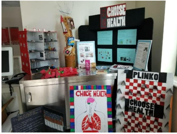
Tobacco education and prevention games, models and presentation materials designed by Boston Asian: Youth Essential Service teenagers

The Boston Asian Youth Essential Service implemented a tobacco education program for Chinatown teenagers, who are at a critical and vulnerable age for picking up smoking since they are susceptible to peer pressure and external influences. The program engaged 13 teenagers in an intensive tobacco education series intended to train the teens to be peer educators. The teen cohort then created presentations, quizzes, games, and displays to educate their fellow Chinatown teens about the dangers of tobacco use, harmful cigarette ingredients, and how to identify and resist tobacco marketing aimed at youth. The teens reached over 700 individuals