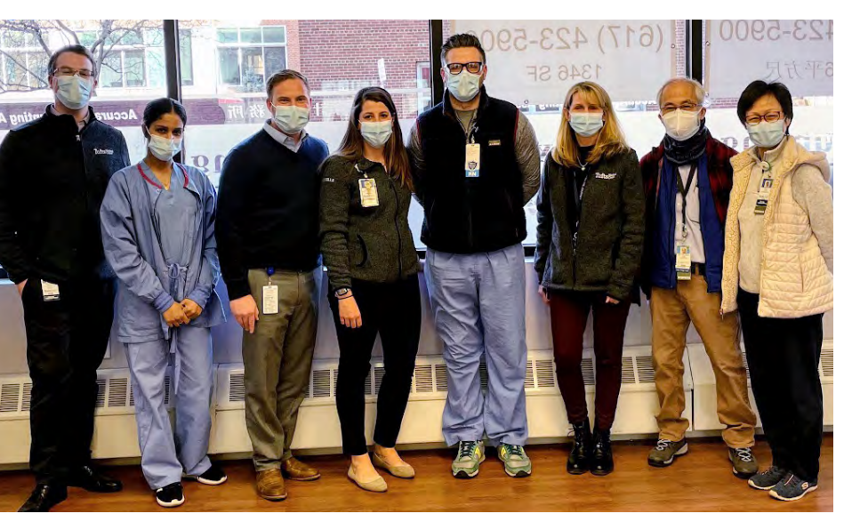
Tufts MC staff provided mobile COVID clinic to residents of Tai Tung Village in Chinatown