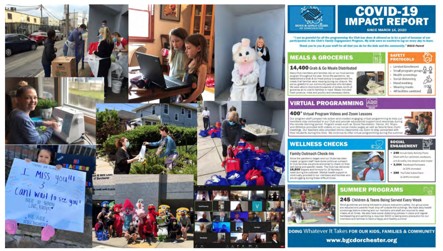
Boys and Girls Club of Dorchester COVID-19 Impact

600 Chinatown youth participated in the Anti-Cigarette Butt Campaign.